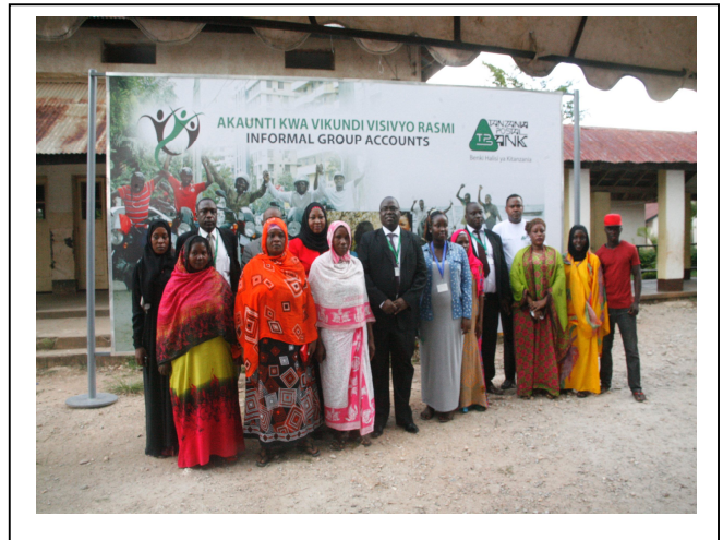
Launching of Informal Group Account by Tanzania Postal Bank