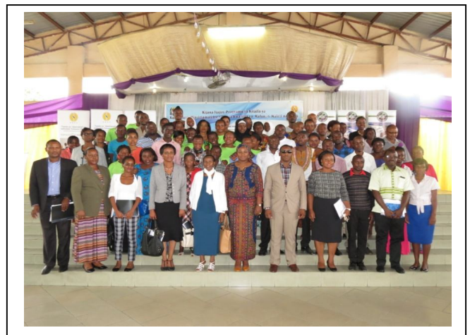
Group photo taken during the launch of Kijana Jiajiri program for Dar es salaam Region