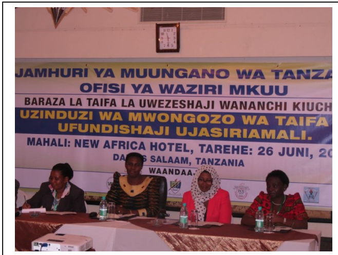
Launching of Entrepreneurship Training