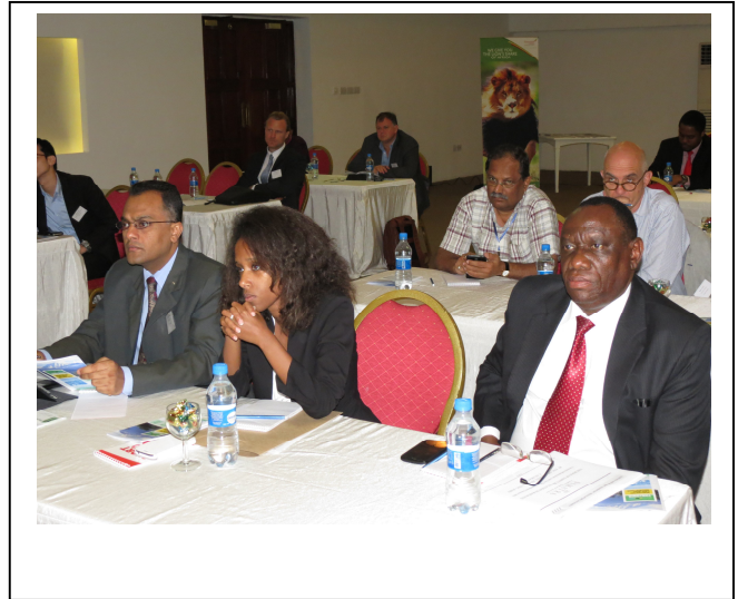
New Energy Investment Forum Participants