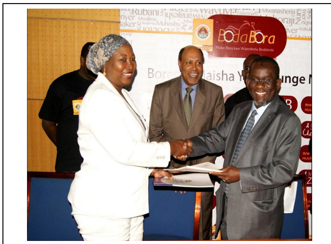
Agreement signing ceremony between NEEC and NSSF to support the Implementation of NSSF BodaBoda program