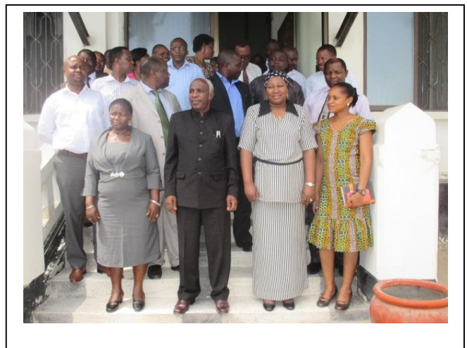
NEEC staff in a group photo with the Minister Of State, Prime Minister's Office, Hon Eng Christopher Chiza, during his visit to NEEC