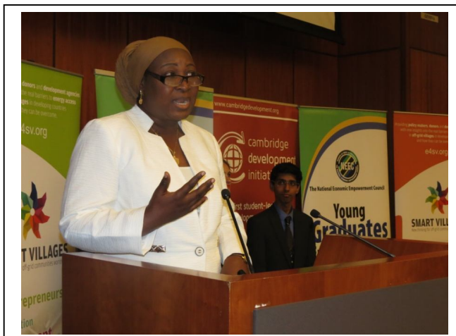
Closing Ceremony of the two months Entrepreneurship training run by Cambridge Development Initiative (CDI) and NEEC