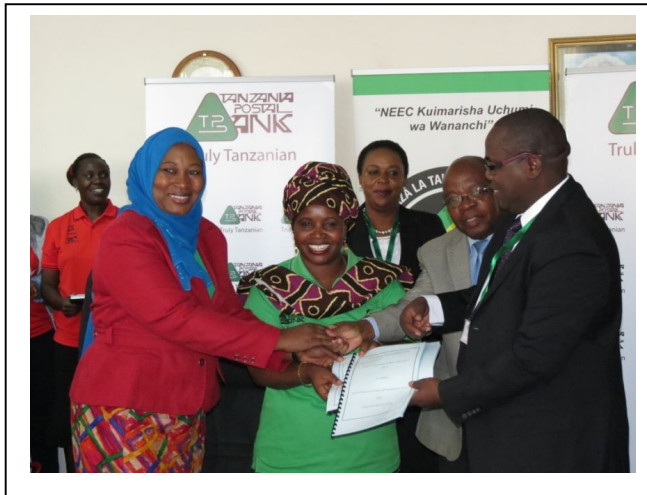
NEEC and TPB signs the agreement to Empower VICOBA and other groups