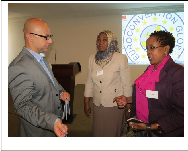
New energy investment Forum