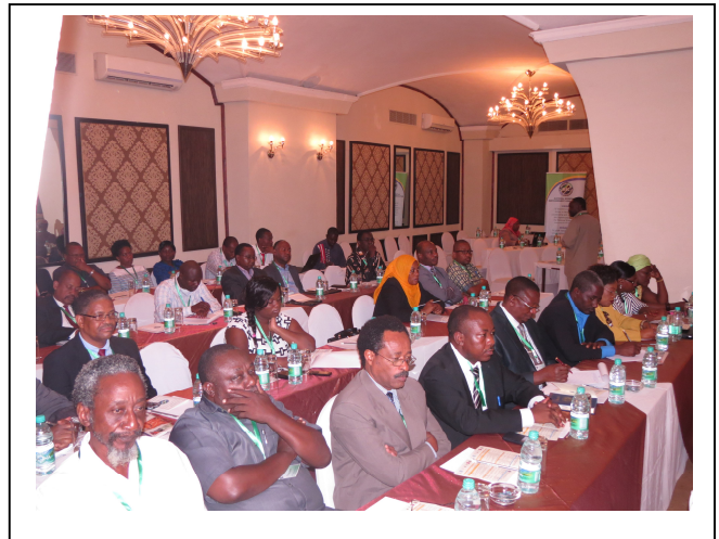
Participants of the NETF Launching